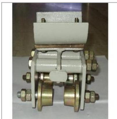
Moving Type Single Cable Trolley 75 MM