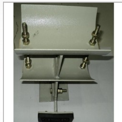
Fixed Type Multi Cable Double Deccar Trolley 200 MM