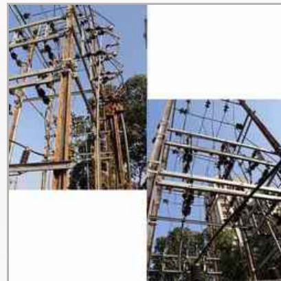
Over head line H T & L T Installation