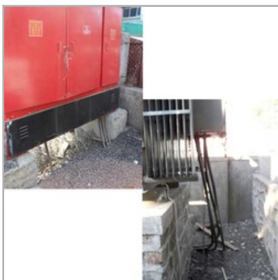
Laying of H T Cable & LT Cables