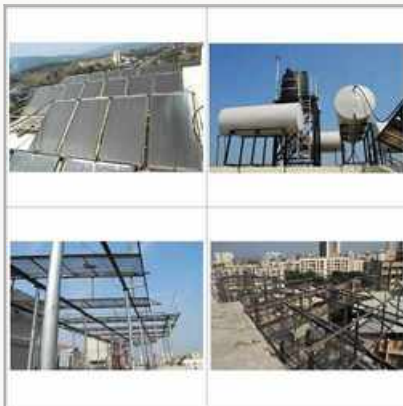
Solar System Structure Fabrication

We, Asha Fabricators, Thane, are engaged in offering unmatched quality products to our clients, which is widely used in various industries. These are available in various specifications and known for the durability features. Our range includes: