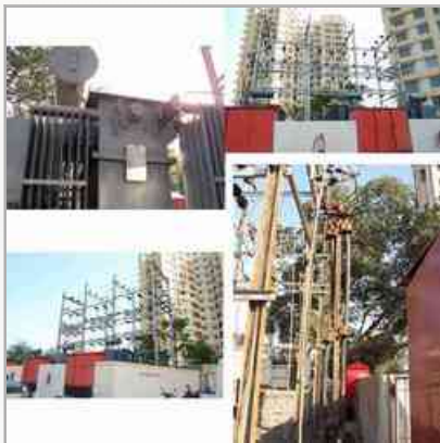
Installation of Transformer

We, Asha Engineering Works, Thane, are engaged in offering reliable services to our clients at industry leading prices. These services are acknowledged for the timely execution characteristics. Our range includes: