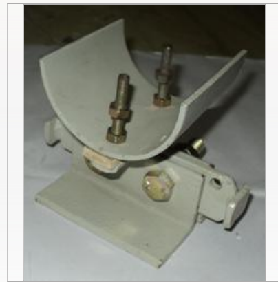
Fixed Type Single Cable Trolley 75 mm