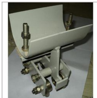
Moving Type Single Cable Trolley 150 MM