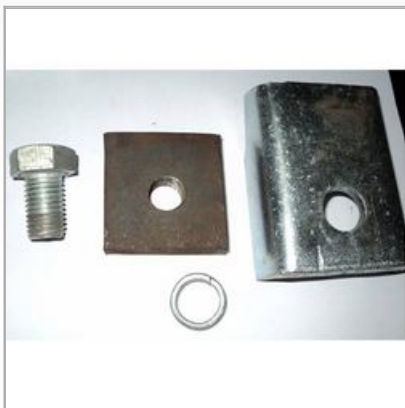
Rail Clamp Parts