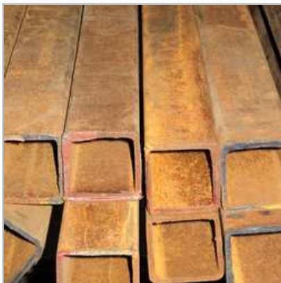
MS Square Bar