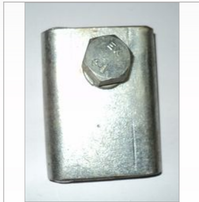
Rail Clamp 90 LBS