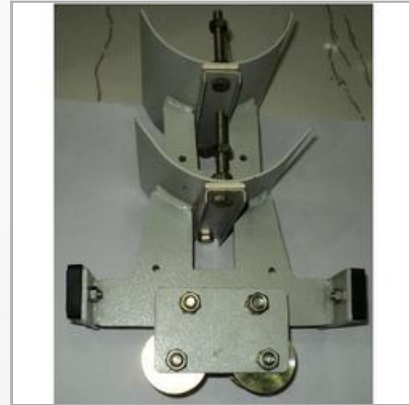
Moving Type Double Deccar Multi Cable Trolley 200 MM