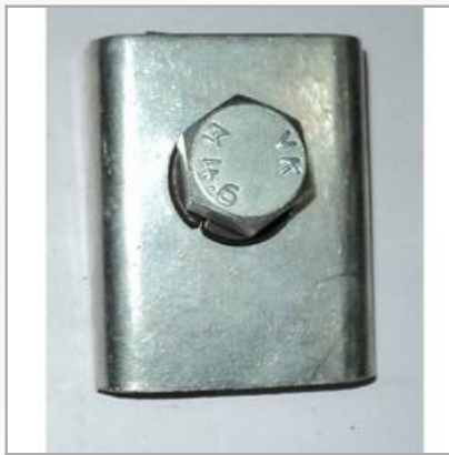
Rail Clamp 60 LBS

Asha Industries, Thane holds expertise in offering an extensive range of Industrial and Fabrication Products, which is manufactured using best grade raw materials. Our range is highly appreciated for the durability, robust construction and excellent strength features. These products include: