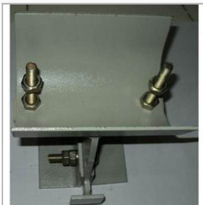
Fixed Type Multi Cable Trolley 150 MM