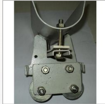
Moving Type Single Cable Trolley 240 MM