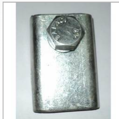
Rail Clamp 120 LBS