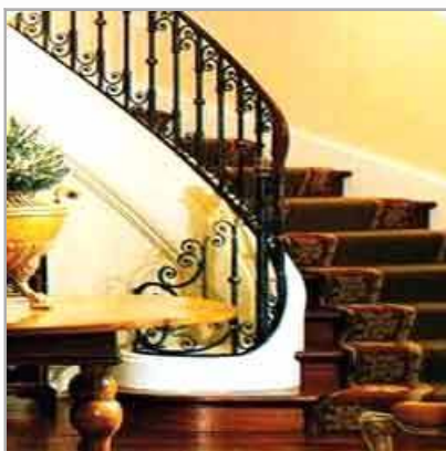
MS Staircase Railing