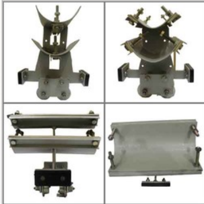
Double Deccar Cable Trolley (For EOT Cranes)