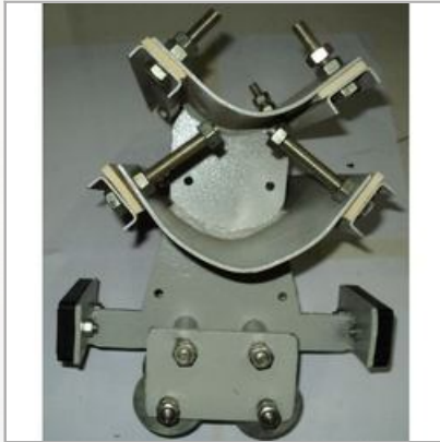
Moving Type Double Deccar Multi Cable Trolley 300 MM