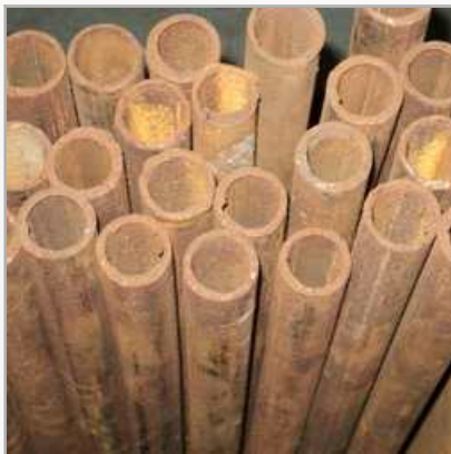
MS Round Pipe

Asha Enterprises, Thane (M.S) holds expertise in offering an exclusive range of products to our clients, which is widely used in various industries. We also provide customized solution to our clients as per their requirement. Our range includes: