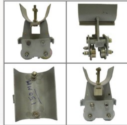
Moving Cable Trolley (Of EOT Cranes)