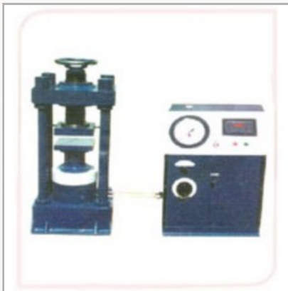
Compressive Strength Tester

We are engaged in offering Compression Testing Equipment includes Compression Testing Machine.