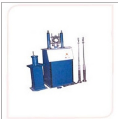
Marshall Stability Test Apparatus