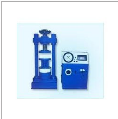
Semi Automatic Digital Compression Testing Machine