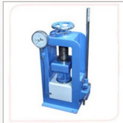
Compression Testing Machine