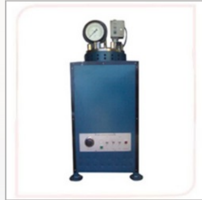
Laboratory Cement Autoclave