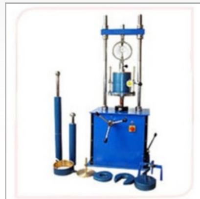
Laboratory CBR Apparatus