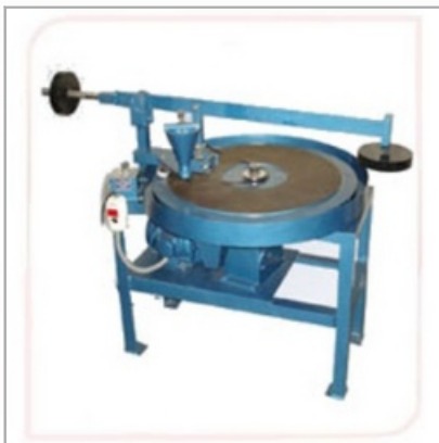
Tile Abrasion Testing Machine