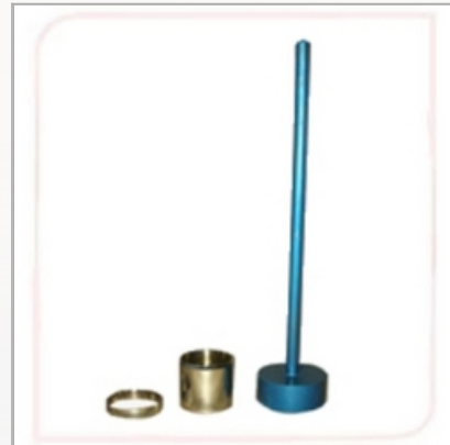
Field Density Kit IS