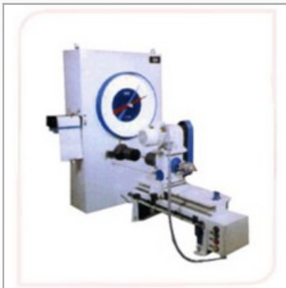
Torsion Testing Machine