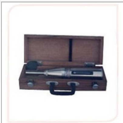
Concrete Test Hammer