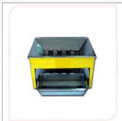
Riffle Sample Dividers