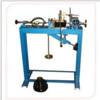
Direct Shear Apparatus