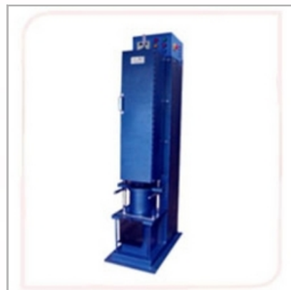
Automatic Bituminous Compactor