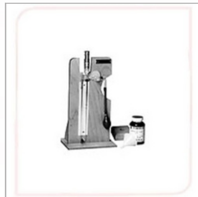
Blain Air Permeability Apparatus