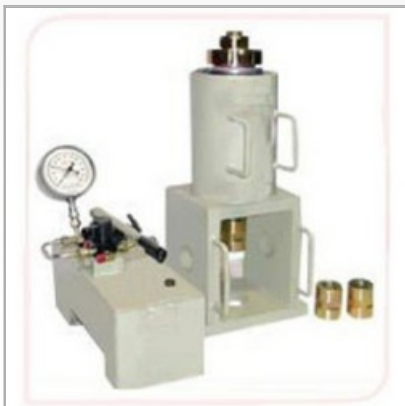
Rock Bolt Pull Out Test