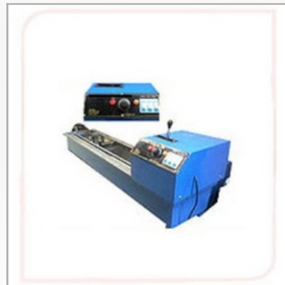
Ductility Testing Apparatus