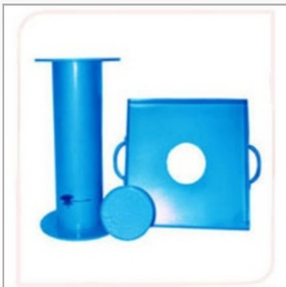
Sand Pouring Cylinder