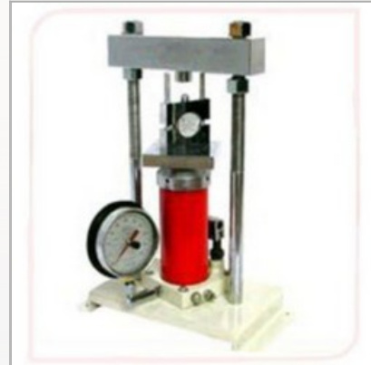
Brazilian Test Apparatus