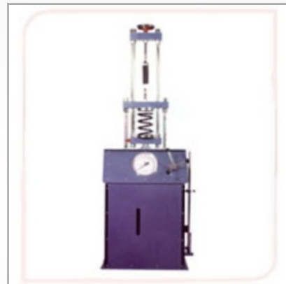
Spring Testing Machine