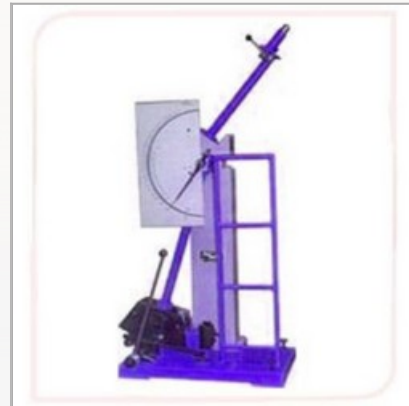
Impact Testing Machine