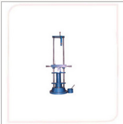
Aggregate Impact Tester

We are a well known name in manufacturing testing instruments which are available in economical prices. These products are well integrated with various essentials. Following are the products we are offering under this category: