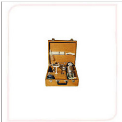
Soil Moisture Meter