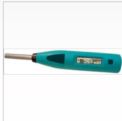
N Type Schmidt Test Hammer