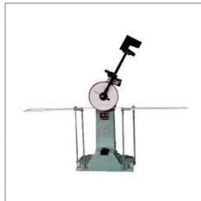
Automatic Testing Machine