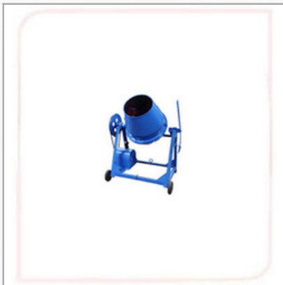
Laboratory Concrete Mixer

Our team of experts has enabled us in manufacturing the most qualitative range of machines at economical prices. The entire range ensures accuracy, reliability and timeliness in working. Under this category, we present the following products: