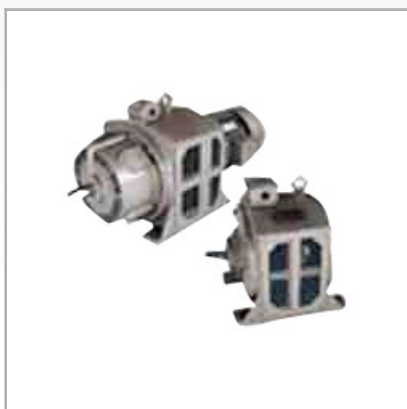
Eddy Current Brakes