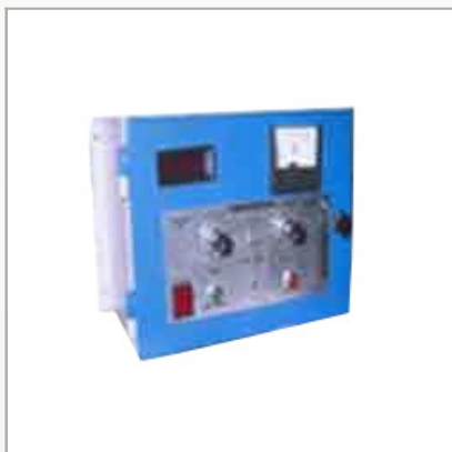
Web Tension Control Systems