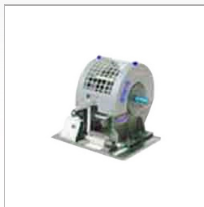
AC Regenerative Dynamometer