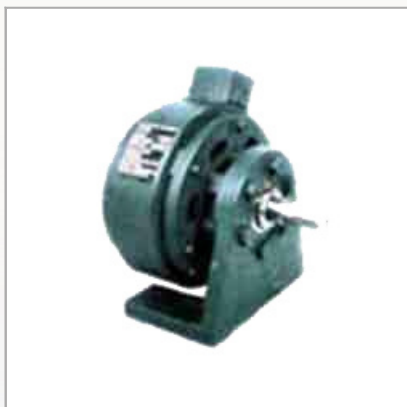
Magnetic Powder Brakes