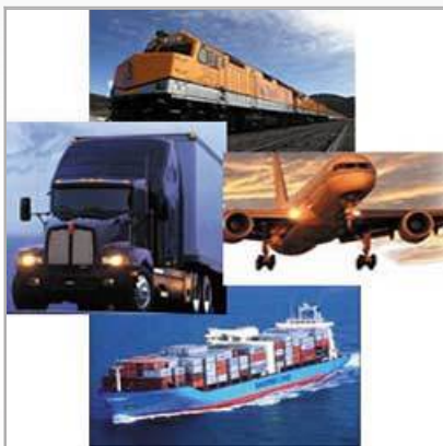
Import Export Regulations