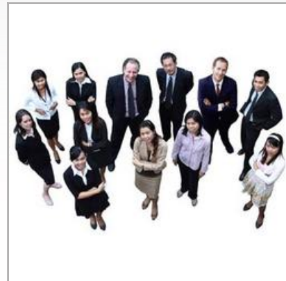
Knowledge Process Outsourcing