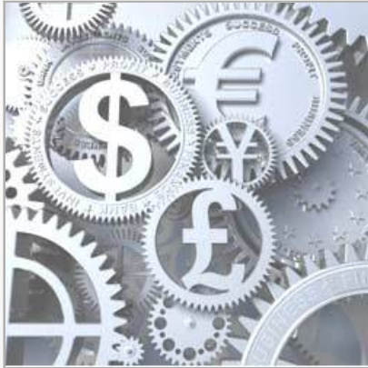
Foreign Exchange Management Act