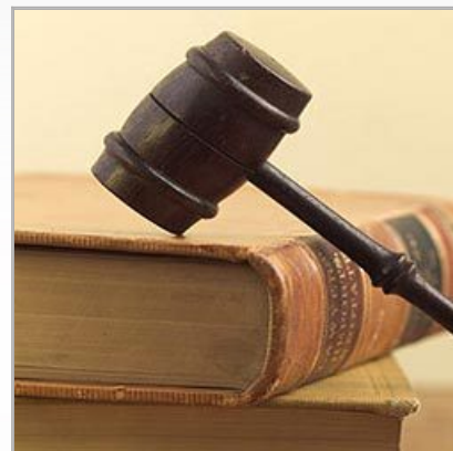
Corporate Law Services