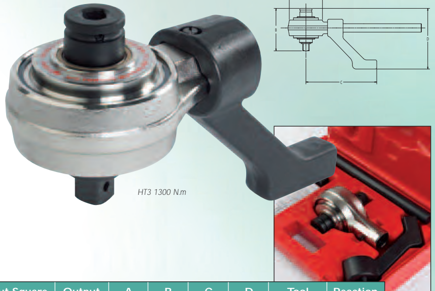
HT3 1300 N.m