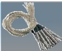
High Watt Density Cartridge Heaters