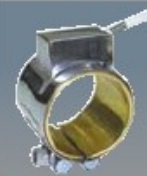
Mica Nozzle Heaters