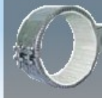
Ceramic Band Heaters