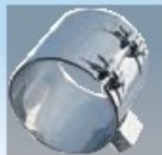
Mica Band Heaters