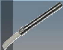
Low Watt Density Cartridge Heaters