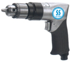
SS5100A High Speed Drill 3/8" Cap