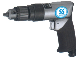
SS5305A Capacity Drill 3/8"