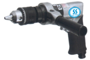
SS5305-8A Capacity Drill 1/2"