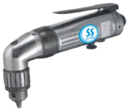
SS5355 Angle Drill