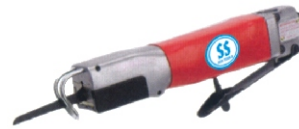
SS4700B Air Saw