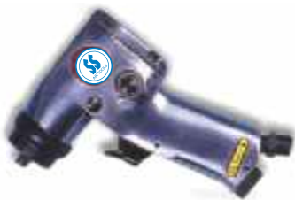
★ Single Hammer SG-0775 3/8"