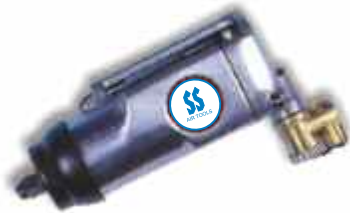
★ Single Hammer SM-401 3/8" Butterfly Impact Wrench