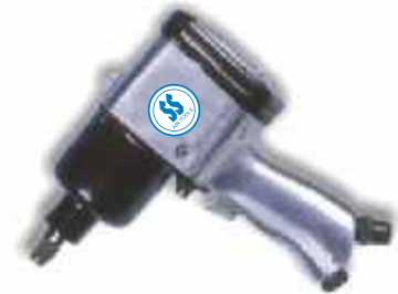
★ PN Clutch SG-0717 1/2" SG-0717L 1/2"