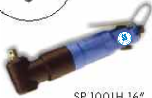
SP-100LH 1/2" Side exhaust