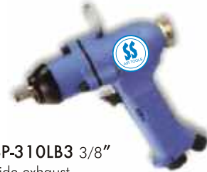
SP-310LB3 3/8" Side exhaust