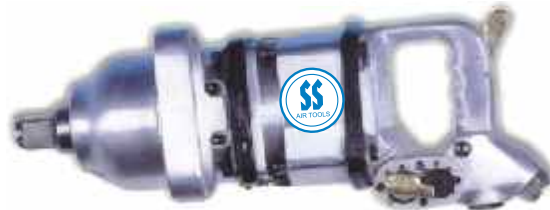
★ Single Hammer SG-0705S 1" W/2" ANVIL SG-0705L 1" W/6" ANVIL