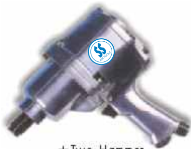
★ Two Hammer SG-0752 3/4"