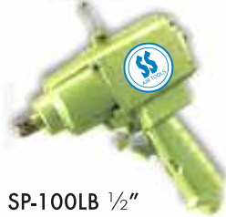
SP-100LB 1/2" Side exhaust