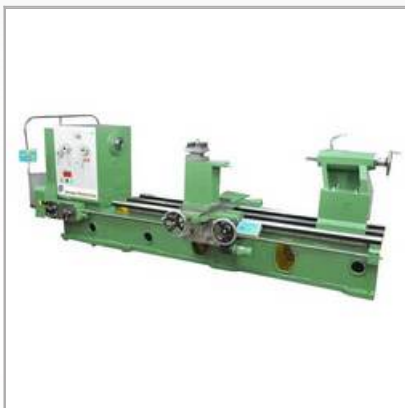
Extra Heavy Duty All Geared Lathe