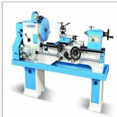
Medium Duty Lathe Machines