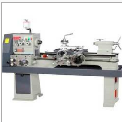
Light Duty All Geared Lathe Machines