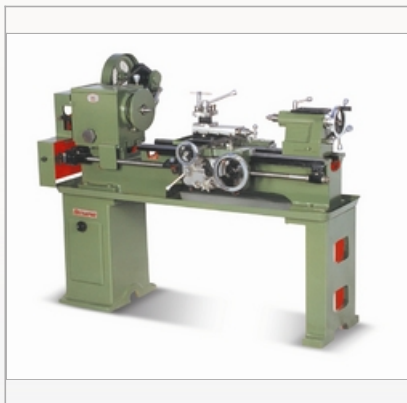
Light Duty Lathe Machines