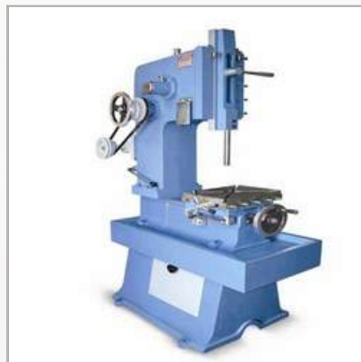
Extra Long Leg Slotting Machines