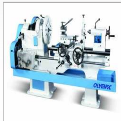
Heavy Duty Lathe Machines