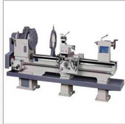
Extra Heavy Duty Lathe Machines