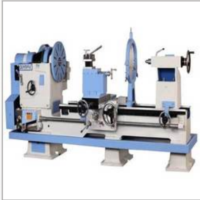
Supper Extra Heavy Duty Lathe Machines