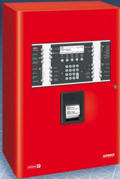
Integral IP MXF