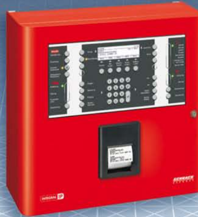
Integral IP CXF