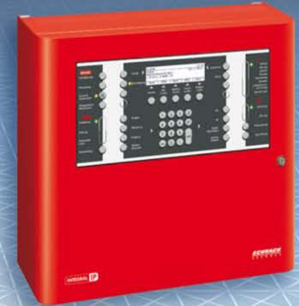
Integral IP CXA & CXB