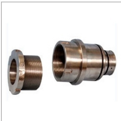
Secondary Stuffing Box