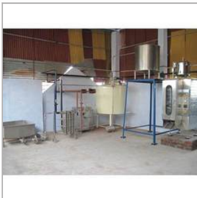
Complete Turn Key Project For Milk Processing Unit