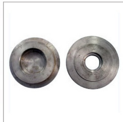
Main Housing DE and NDE Cover