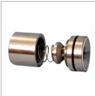
Pump Valve Assembly