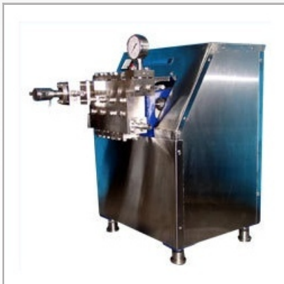
Ice Cream Homogeniser