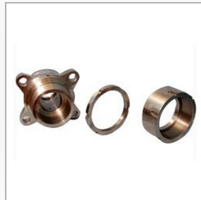
Stuffing Box Assembly