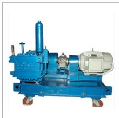
High Pressure Pump With Gear Box