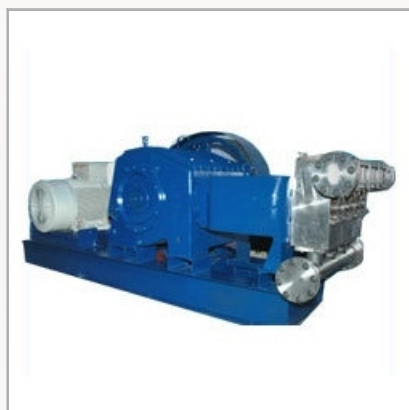
High Pressure Pumps

We offer our clients, with a technically upgraded assortment of high pressure pumps that are sturdy and robustly constructed. These high pressure pumps find application in varied industries and are available for our clients, at most competitive price.