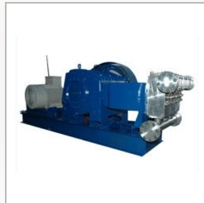
Industrial Plunger Pumps