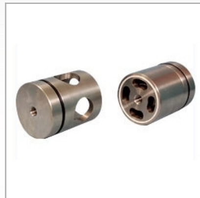
Pump Valve Spacer