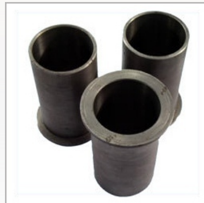
Cross Head Sleeve