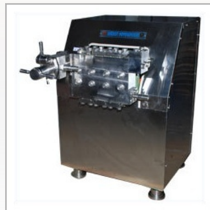
Homogeniser For Ice Cream