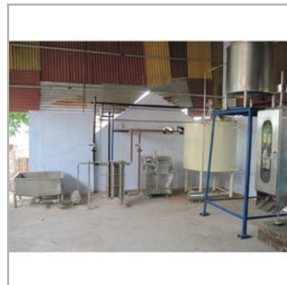
Turnkey Project Product For Dairy Industry