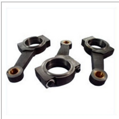
Connecting Rod Assembly