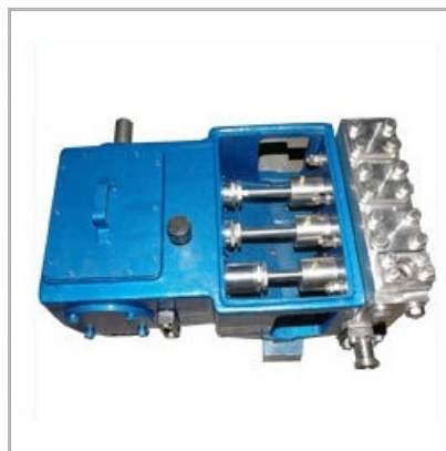
Lower Capacity Bare Pumps