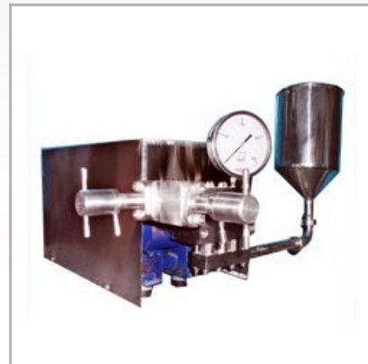
Low Pressure Homogeniser