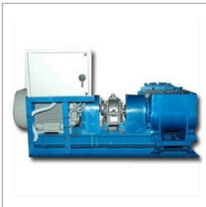
High Pressure Triplex Plunger Pumps