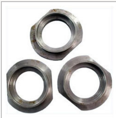
Oil Seal Cover

We hold expertise in fabricating and offering a wide range of drive end spares that are applicable in diverse industry verticals. Widely appreciated for their durability and strength, these drive end spares are customized for our clients at various specifications to choose from.