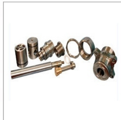
Homogeniser Spare Parts