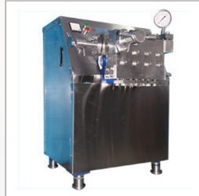
Fruit Juice Homogeniser