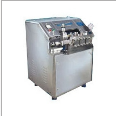
High Pressure Homogeniser