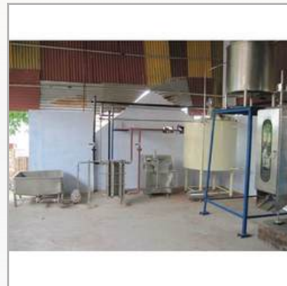
Turn Key Project For Dairy Milk