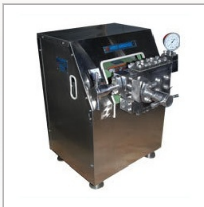
Homogeniser For Fruit Juice

We specialize in the production of homogenisers that is carried out under high pressure and velocity, guided into micron clearance to impinge over the impact ring. These homogenisers comply with the industrial quality standards and are offered to our clients in standard and customized forms.