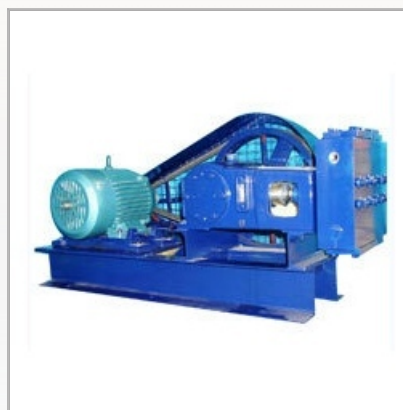
High Pressure Pump With Accessories