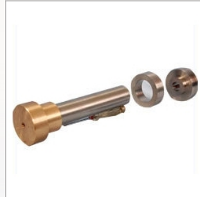
Homogeniser Valves and Accessories