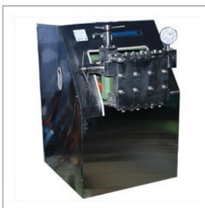
Homogeniser For Dye Chemical