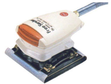
FS-100C / FS-50A Free Sander