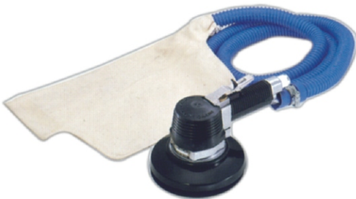
OSV-60A Orbital Sander