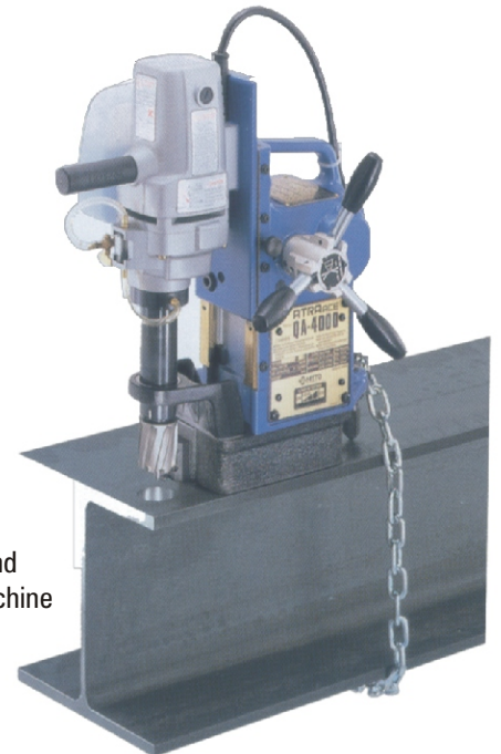
Portable Cutting with magnetic stand punching / drilling machine