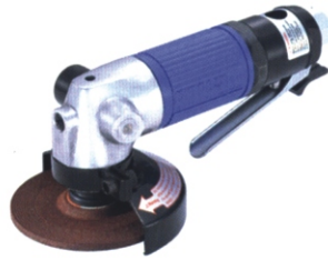
MAGW-40 4\"(100mm) Grinder