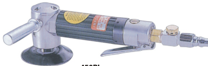
450PL Compact Mini-Sander (2\" / 3\")