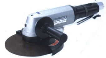
MAG-70 7\"(180mm) Grinder