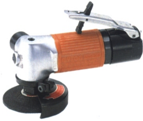
MAG-25B Grinder 58mm