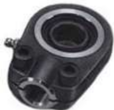
Forged rod end mounting with spherical ball bearing