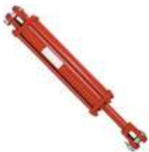
female clevis, 4 stud design