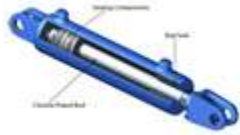
Female clevis mounting