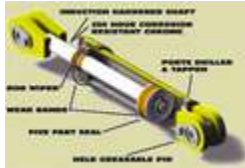
Female clevis mounting