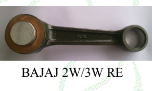
BAJAJ 2W/3W RE