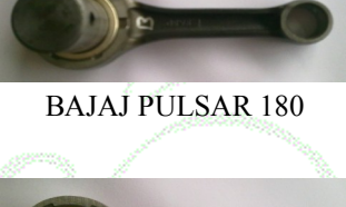
BAJAJ PULSAR 180