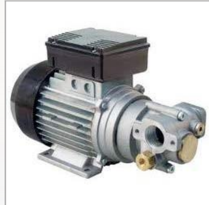
Oil Transfer Gear Pump