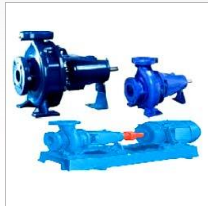
Chemical Process Pump