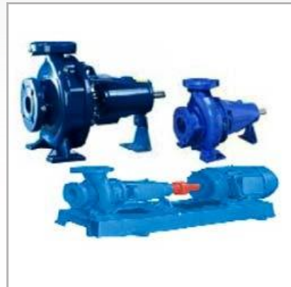
End Suction Pump / Process Pump