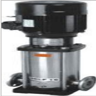
Multi Stage In Line Pump & High Pressure Pump