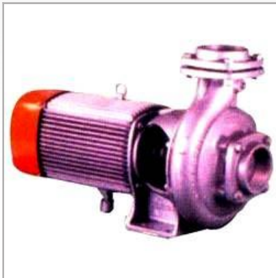
Centrifugal Monoblock Pump