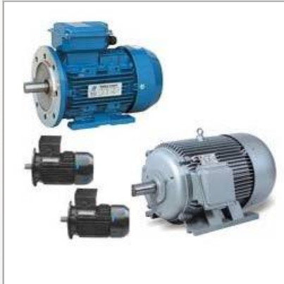
Induction Motor Pump