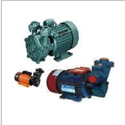
Self Priming Pump