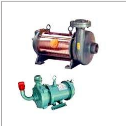
Submersible Monoset Pump