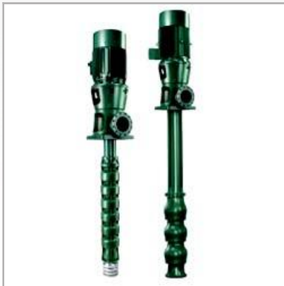
Vertical Turbine Pump