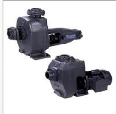
Self Priming Mud Pump