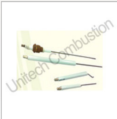
H Type Electrode

This Ignition Electrode is used in different applications like Gas appliances, Ovens, Water heaters, Boilers. These include Ignition Electrodes, H Type Electrodes, Ignition Electrodes & Ionization Probe, Riello Burner Ignition Electrode, H type Electrode . This electrode can be availed by our clients in various sizes and at most comprehensive prices.