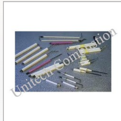
Ignition Electrodes & Ionization Probe