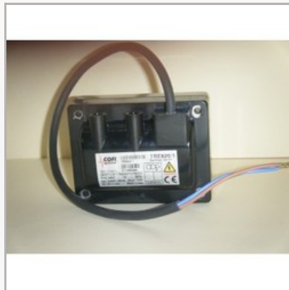
Cofi Ignition Transformer