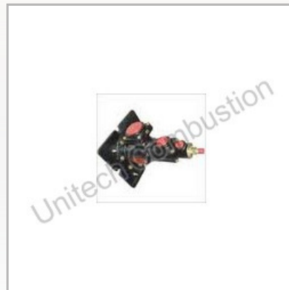
Melting Furnace Gas Burner