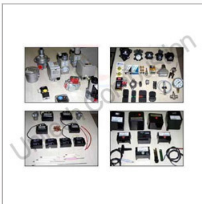
Oil & Gas Burners Spares