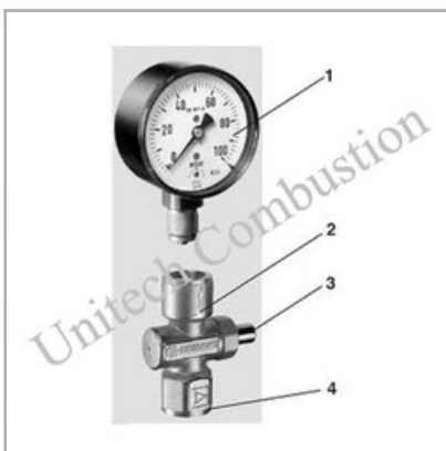
Pressure Gauge & Attachment