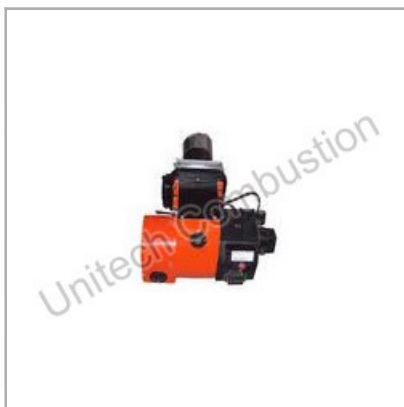
Fuel Oil Burners