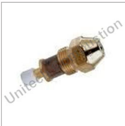
Bentone Oil Burner Nozzle