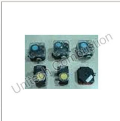
Dungs Air Pressure Switches

We provide a huge demand of pressure switches are highly appreciated in the market owing to their features such as compact designs, reliable performance, and low maintenance easy operation and easy to use. We manufacture the switches using finest quality materials based on the latest ultra modern technology in comply with the quality standards and norms.