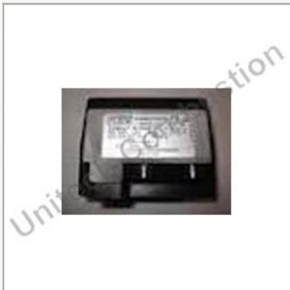
Fido Ignition Transformer

We offer Ignition Transformers to our clients at wide range. These transformers include Fido Ignition Transformer, Coif Oil Gas Transformer, Siemens Ignition Transformer, Danfoss Oil, Gas Transformer, Weishaupt Ignition Transformer. These transformers are very strong and offer excellent performance.