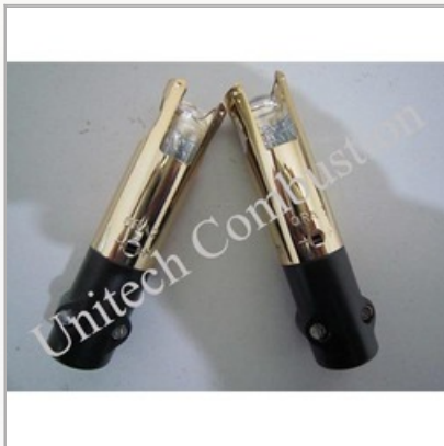
Landis GYR UV Cell QRA 2

We are providing Flame Sensors & Photo Cells to our customers at wide range. These include Landis GYR UV Cell QRA 2, Satronic Photo Cell MZ 770S, Satronic UVZ 780 Photo Cell, Satronic and Honeywell Photo Cell, Riello Burner Photo Cell. These are made in accordance with domestic and international quality standards.