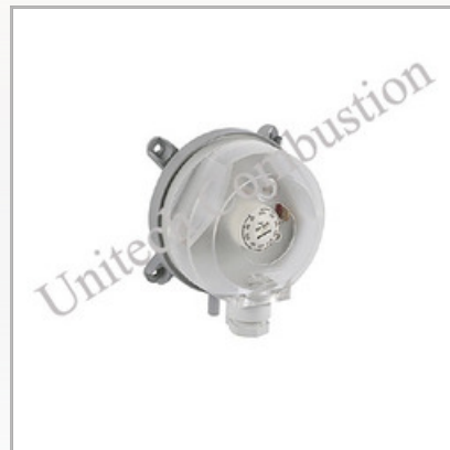
Air Pressure Switch