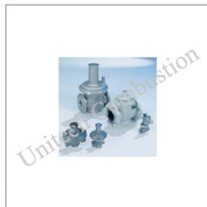
Krom Schorder Pressure Regulating Valve