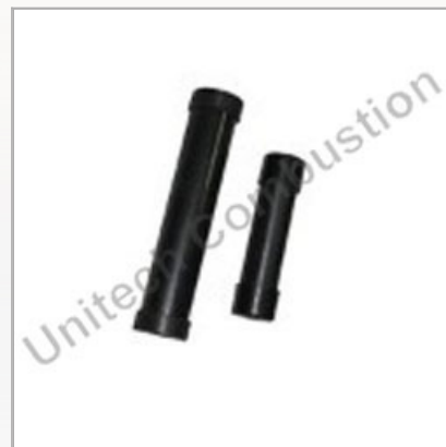
Bentone Oil Gas Burner Coupling