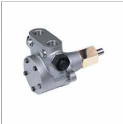
Furnace Oil Pump