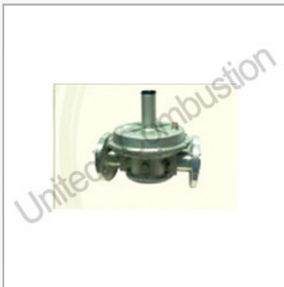
Madaz Gas Regulator

We offer Regulator & Pressure Gauge to our clients at wide range. These include Vanaz Regulator, Vanaz Make Low Pressure Regulator, Madaz Gas Regulator, Dungs Make Pressure Regulating Valve, and Pressure Gauge & Attachment. These products are available in different shapes and sizes and can be modified as per the requirements of the customers.