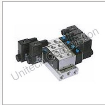
Direction Valve & Cylinder