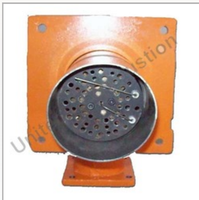
Natural Gas Burner

These Gas Burners are made as per the specifications provided by the customers. These include Natural Gas Burner, LPG Burner, Town Gas Burner, Furnace Gas Burners, and LPG Gas Burners. These burners are available in different shapes and sizes. These are known for their features like robust body construction, corrosion to resistance, light-weight, and stability.