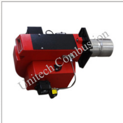
Light Oil Diesel Burner

We offer Oil Burners which are widely used by our clients in huge requirements. These burners are light in weight and easy to maintain. These burners are suitably useful in commercial & industrial burners, hot air generators, thermic fluid heaters and it also consumes power supply.