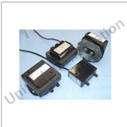
Siemens Ignition Transformer