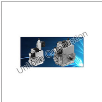
Gas Train Components