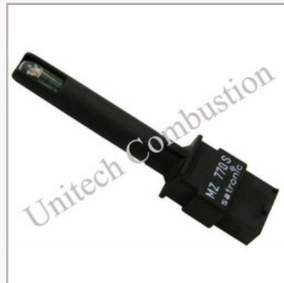
Satronic Photo Cell MZ 770S