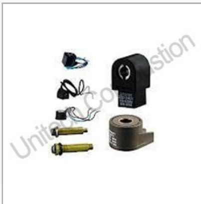
Oil Burner Solenoid Valves And Coils

We are engaged in offering Solenoid Valves & Coils to our customers. These include Oil Burner Solenoid Valves and Coils, Brahma Solenoid Valves, Dungs Gas Solenoid Valves, Korma Schroder Gas Solenoid Valve, Honeywell Gas Solenoid Valve. These are available with international quality standards and as per the specifications provided by the customers.