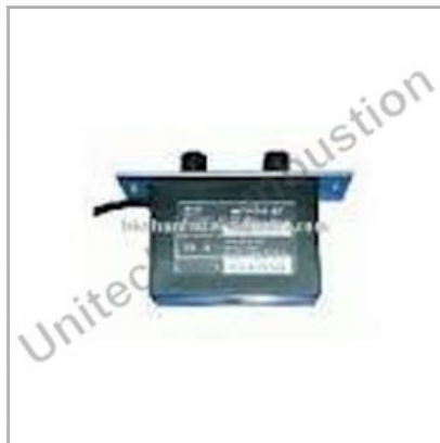
Weishaupt Ignition Transformer