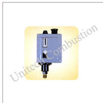
Steam Pressure Switch RT 5 B