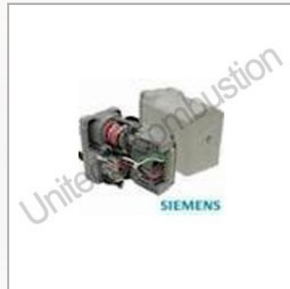
Ecoflam Burner Servo Motor