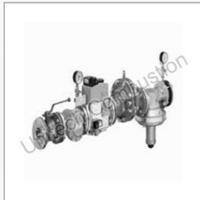
Dungs Make High Pressure Gas Train