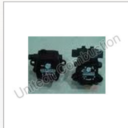
Suntec Oil Pump