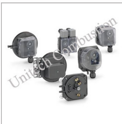
Krom Schorder Air And Gas Pressure Switch