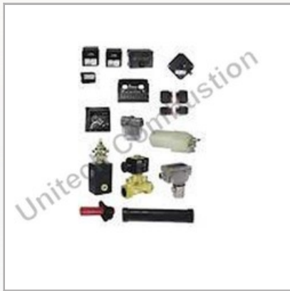
Burner Boiler Spares

We are engaged in offering Boiler & Burners to our valuable clients. These burners are highly compatible and offer true performance. These burners are made using advance technology and as per the domestic and international quality standards. These are used in vast range of industrial and commercial applications.