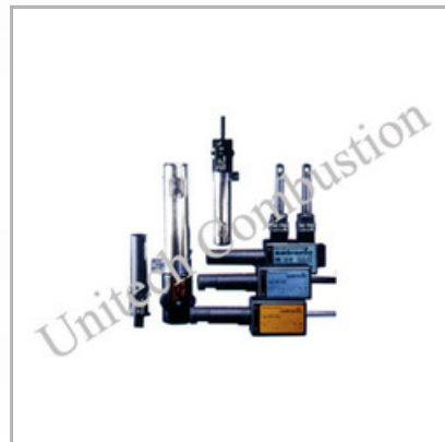
Satronic And Honeywell Photo Cell