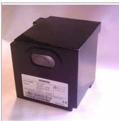
Siemens Controller LFL 1.322