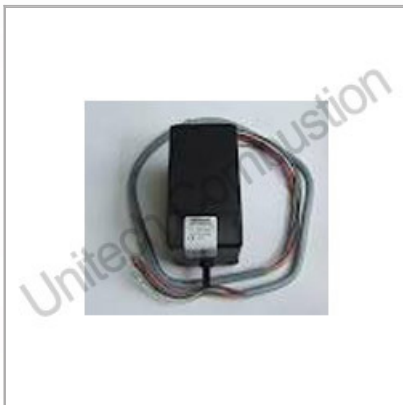
Bentone Damper Motor