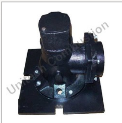
High Temp Burner

We offer a wide array of High temperature burners are high performance, easy installation, less power consumptions, less maintenance, effectiveness and robustness. We fabricate these high temperature burners using finest quality materials based on latest innovative technology. These high temperature burners are available in various technical specifications and requirements.