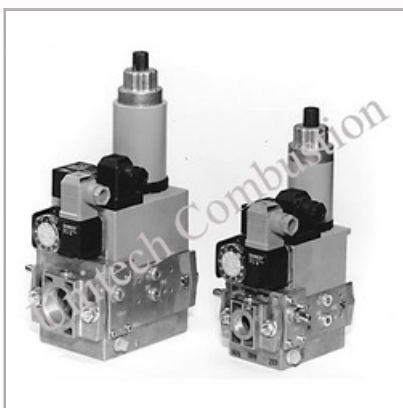
Dungs Gas Solenoid Valve