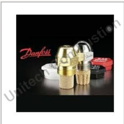
Danfoss Oil Burner Nozzles