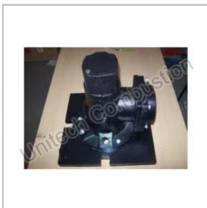
Gas Furnace Burner