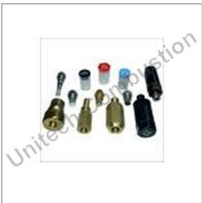
Barganzo Oil Burner Nozzles