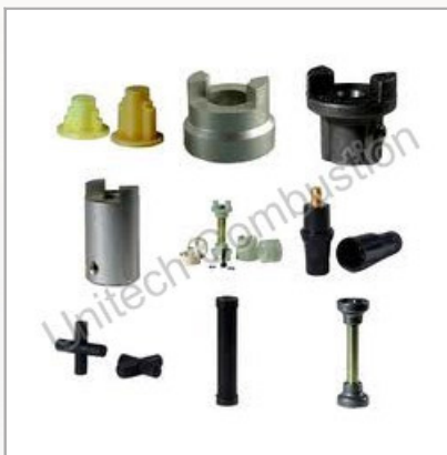
Weishaupt Burner Coupling

We are engaged in offering a wide range of Burner & Spares are comprehensively found applications in various mechanical purposes such as stove or gas and spare are used for repair or replacement of failed parts of any machines etc.