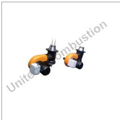
Town Gas Burner