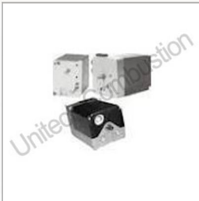
Weishaupt Burner Servo Motor

We provide an exclusive array of Burner servomotors & actuators used in various industrials and engineering applications for air and gas flow modulations. We made these products using optimum quality materials based on latest sophisticated technology, which meets the quality standards. These products clients can avail from us at affordable prices.