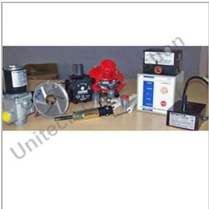
Oil And Gas Burner Spares