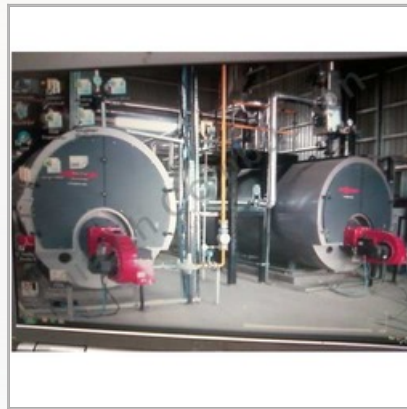
Burners And Boilers