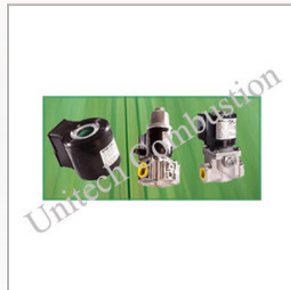
Brahma Solenoid Valves