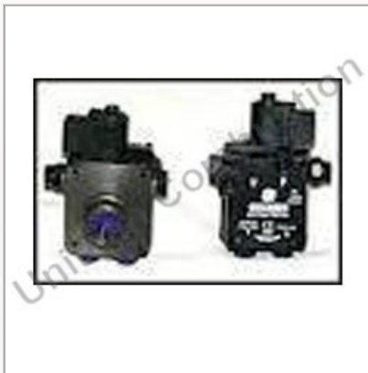
Oil Burner Pump - AS 47 C A

We are offering Oil Burner Pumps which are made using latest technology and highly used by for clients. These include AS 47 C a Pump, Suntec Oil Pump, Fuel Pumps, Danfoss Make Oil Pump, Suntec pump. These pumps are used in different industries and ensure high durability.