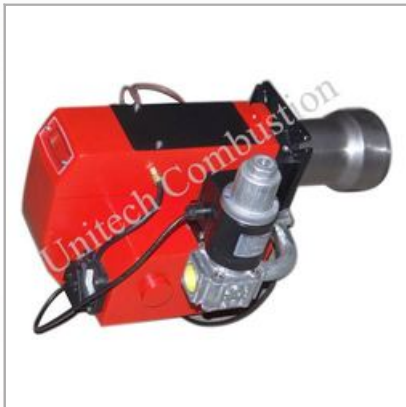
Oil And Gas Burner