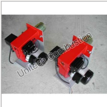
Industrial Oil And Gas Burner

Leading Importer and Supplier of Oil and Gas Burner such as Industrial Oil And Gas Burner, Oil / Gas Dual Fired Industrial Burner and Oil And Gas Burner Spares from Ahmedabad.