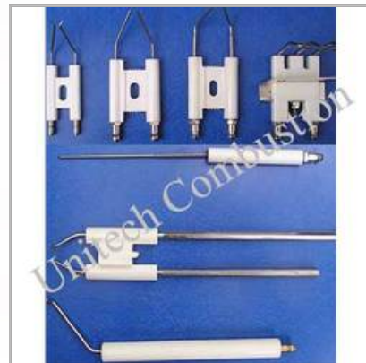
H Type Electrodes