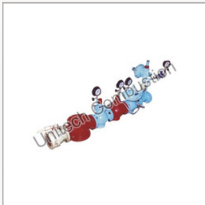
Vanaz Make High Pressure Gas Train

We offer a wide array of Gas Train And Components extensively used in gas filters, valves, safety pressures etc. These gas train and components are highly applauded in the market owing to their features such as durability, reliability, sturdy in nature and longer functional life.