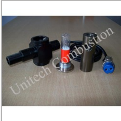
UV Cell Or Flame Detector