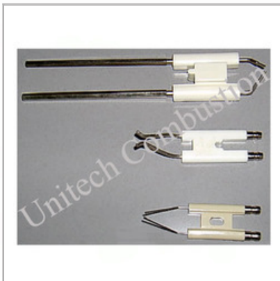
Riello Burner Ignition Electrode