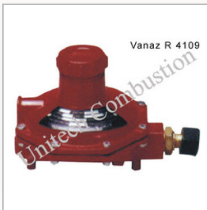
Vanaz Regulators R 4109

We offer wide ranges of Vanaz Regulator are widely appreciated for its best features like optimum performance, durability, quality and reliability. Clients can avail these products in different dimensions and are tested before dispatching to our clients. They are used in various applications in many industries and well known for their longer service life and robust construction.