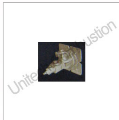
Small Dual Fuel Burner