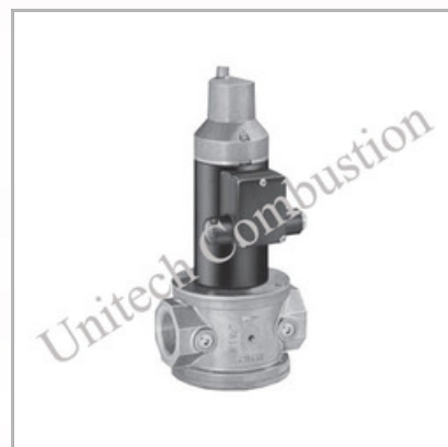
Krom Schorder Gas Solenoid Valve