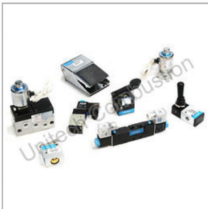
Pneumatic Control Valve