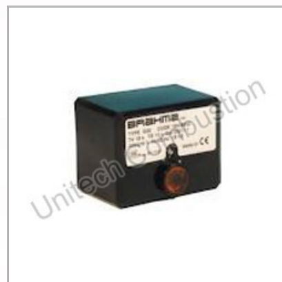
Brahma Sequence Controllers