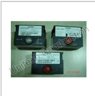
Burner Programmer Control Box

Our wide range of Sequence Controllers is offered to our clients. These include Siemens Burner Controller/ Burner Programmer/ Control Box, Siemens Controller LAL, Brahma Sequence Controllers, Honeywell Sequence Controller Models, Thermal Boiler Sequence Controller. These controllers are manufactured using superior raw materials and using advance technologies.