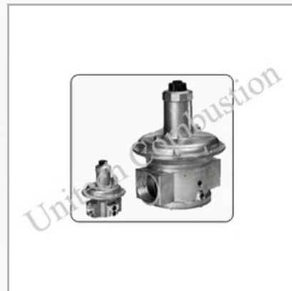
Dungs Make Pressure Regulating Valve