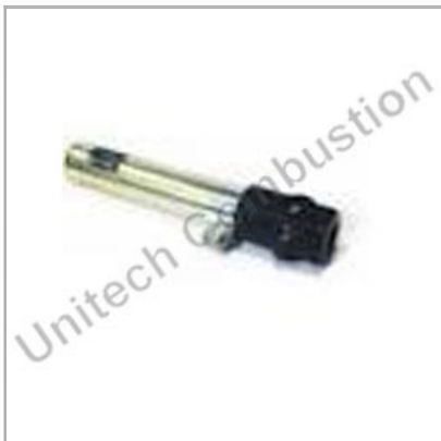
Satronic UVZ 780 Photo Cell