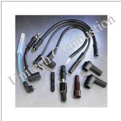
Ignition Lugs & Caps