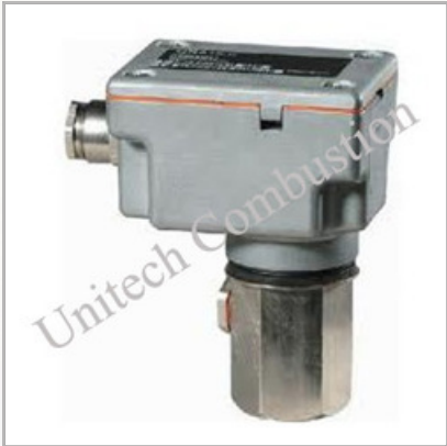
Siemens UV Cell QRA 10.C