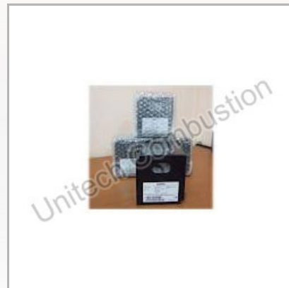
Siemens Controller LAL 2.25