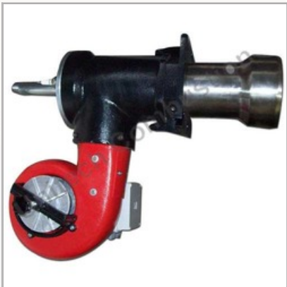
Oil / Gas Dual Fired Industrial Burner