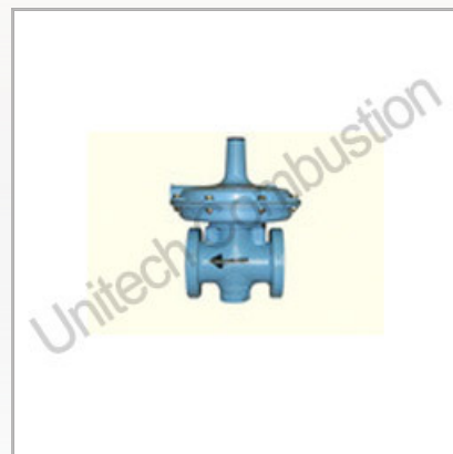
Vanaz Make Low Pressure Regulator