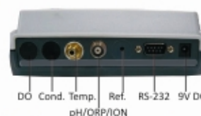
Ports for different electrodes on the rear panel